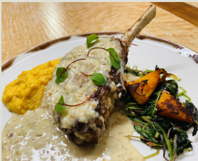
Autumn Frenched Pork Chop

Niman Ranch pork chop, bourbon-Dijon cream sauce, butternut grits, apple ginger mustard greens, roasted squash